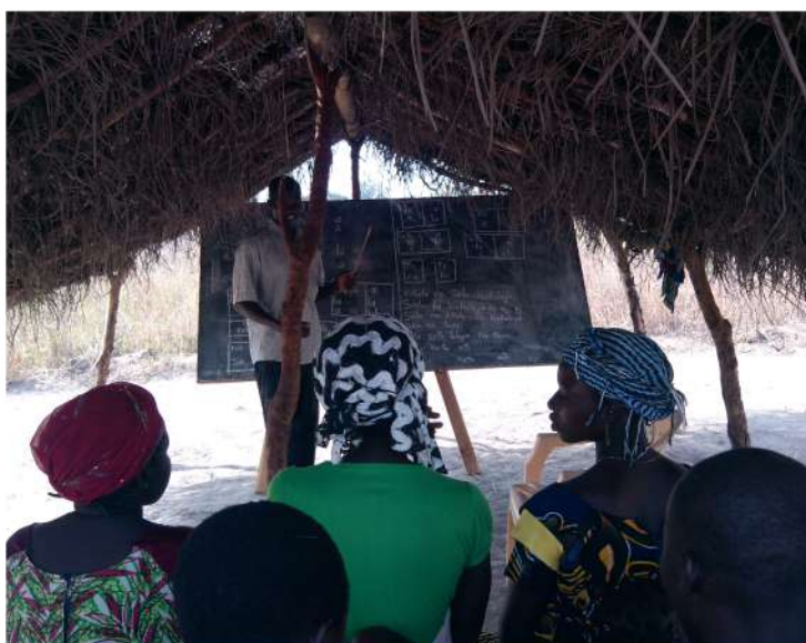
Literacy classes in Tokobio village.

The literacy activities in the villages were carried out with the support of the partners: the local churches, LEI, SIM and the AWOLOU Family Ministry. Thus at the end of 2019, 143 classes were opened by 298 teachers, 2518 students participated in the classes and 2312 has finished the Book 1.